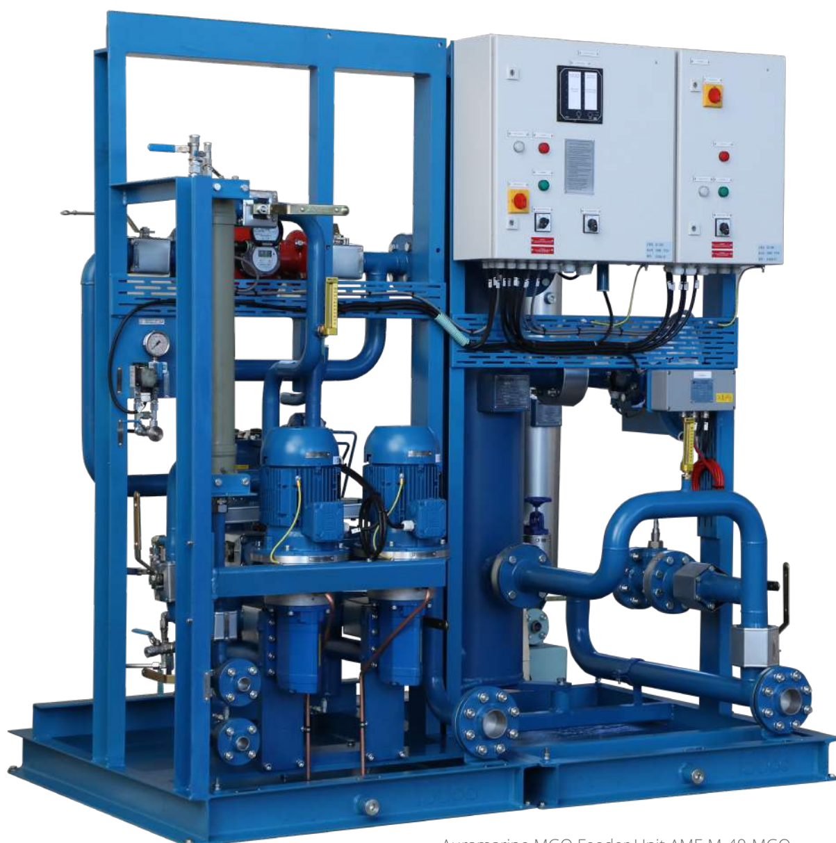
Auramarine MGO Feeder Unit AMF-M-40-MGO

Auramarine Marine Gas Oil supply solutions support operational and environmental efficiency by enabling flexible use of fuels. They comprise MGO Feeder units, or a range of combinations of MGO Feeder part, and MGO Booster part(s) designed to serve single or multiple engine configurations.