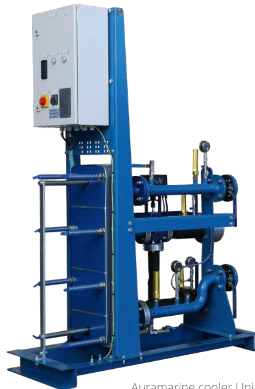
Auramarine cooler Unit (ACU)

Auramarine MGO units come in capacities equal to conventional Auramarine HFO boosters, power range 1-60 MW. Further capacities are available upon request.